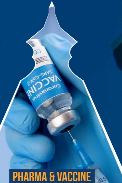
PHARMA & VACCINE